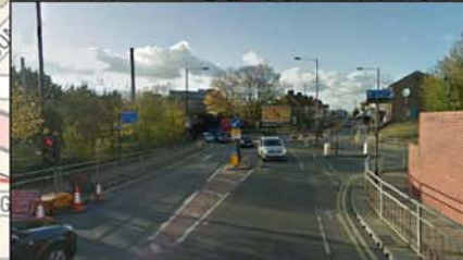
REALIGN STAGGERED FOUR ARM JUNCTION AND PROVIDE MANDATORY CYCLE TRACK