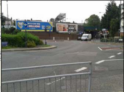
REALIGN TWO ARMS OF ROUNDABOUT TO PROVIDE FACILITY FOR SAFER CYCLE MOVEMENT ACROSS THE ROUNDABOUT