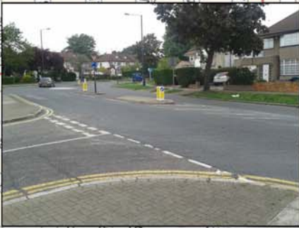
REALIGN MINI-ROUNDABOUT AND SPLITTER ISLAND AND INTRODUCE TURNING RESTRICTIONS TO FACILITATE CYCLE MOVEMENTS