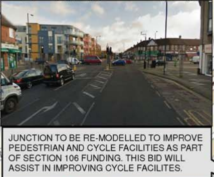
JUNCTION TO BE RE-MODELLED TO IMPROVE PEDESTRIAN AND CYCLE FACILITIES AS PART OF SECTION 106 FUNDING. THIS BID WILL ASSIST IN IMPROVING CYCLE FACILITIES.