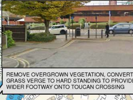
REMOVE OVERGROWN VEGETATION, CONVERT GRASS VERGE TO HARD STANDING TO PROVIDE WIDER FOOTWAY ONTO TOUCAN CROSSING