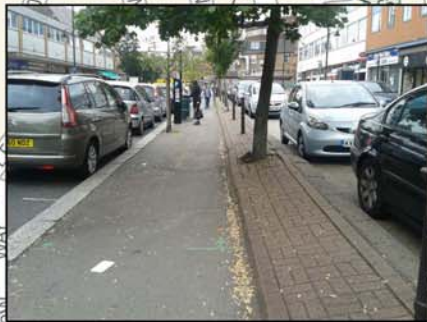
RECONSTRUCT SERVICE ROAD AND PEDESTRIAN FOOTWAY TO REMOVE LEVEL DIFFERENCES. CONVERT PEDESTRIAN FOOTWAY TO SHARED USE.